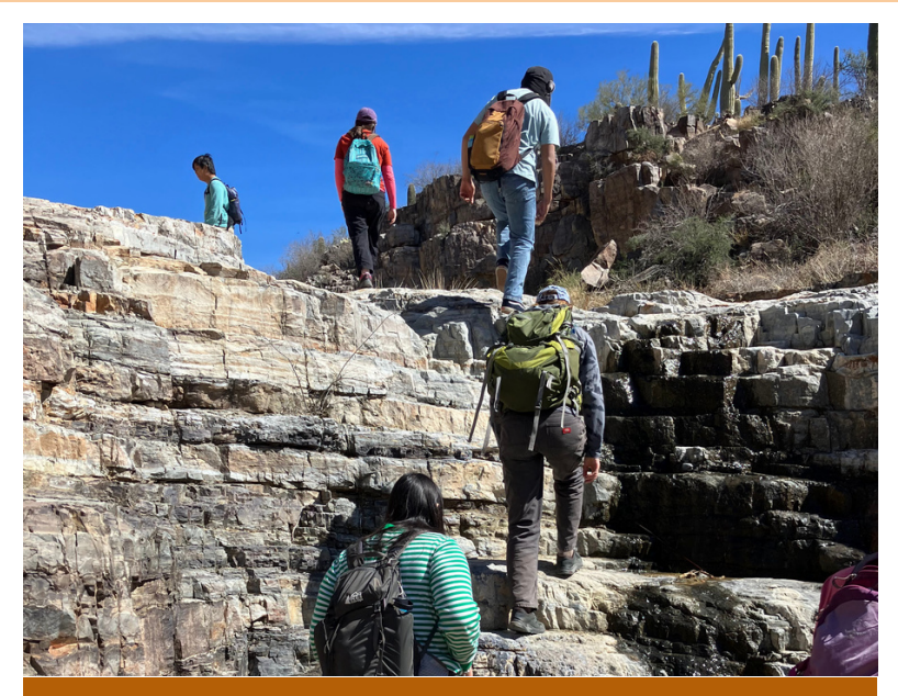
Interns hiking at King Canyon (Saguaro National Park West)

Feedback from the group indicates that YBS continues to be a dynamic and influential program. However, interns found crafting their "climate story" broad and challenging, indicating that the program's focus still needs to become more specific in scope. Finally, staff & interns both noted that they wished the youth had been able to spend more time meeting and engaging with community members & connecting with the natural world.