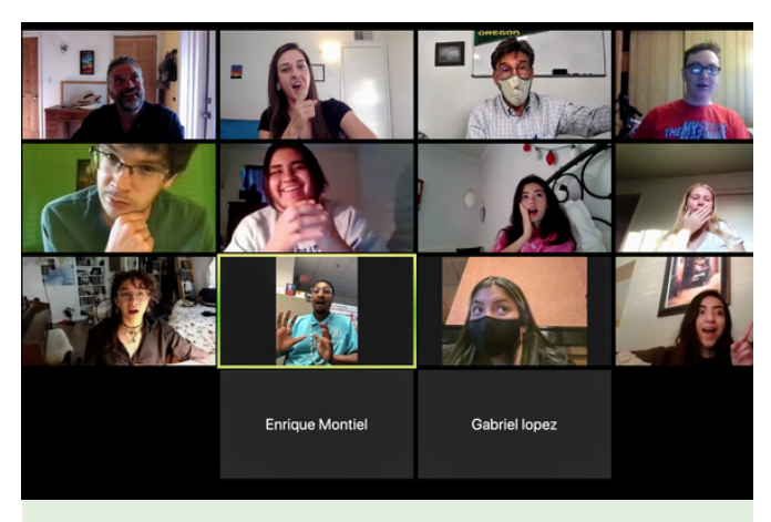
WORLD WILD WEB (WWW) IN ACTION

To expand engagement opportunities, Creativity on the Fly took flight by inviting community members, ages 12-20, to paint, write, draw, and document the intersections of humans and birds.